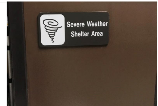
Figure 4: Information on weather (example Atlanta, USA)