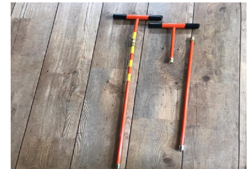
Figure 7: Can you take all your equipment with you or do you need to modify certain pieces of equipment (e.g. your probe)?