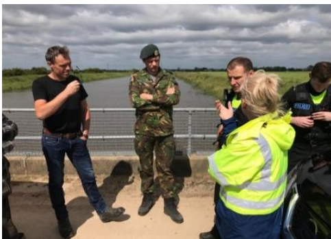
Figure 5: SCW/WTEc in discussion with locals and local authorities, Wainfleet, 2019