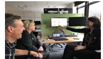
Figure 1: Visit to office of Environment Agency during the crisis at Wainfleet 2019.