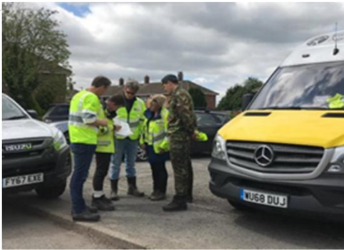
Figure 2: Mobile information facility Environment Agency during evacuation, Wainfleet 2019