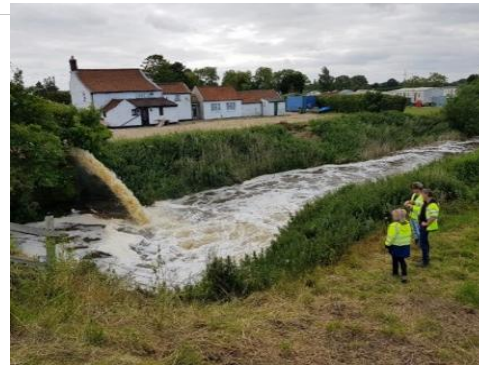
Figure 3: implementation of emergency measures during dike breach Wainfleet, 2019